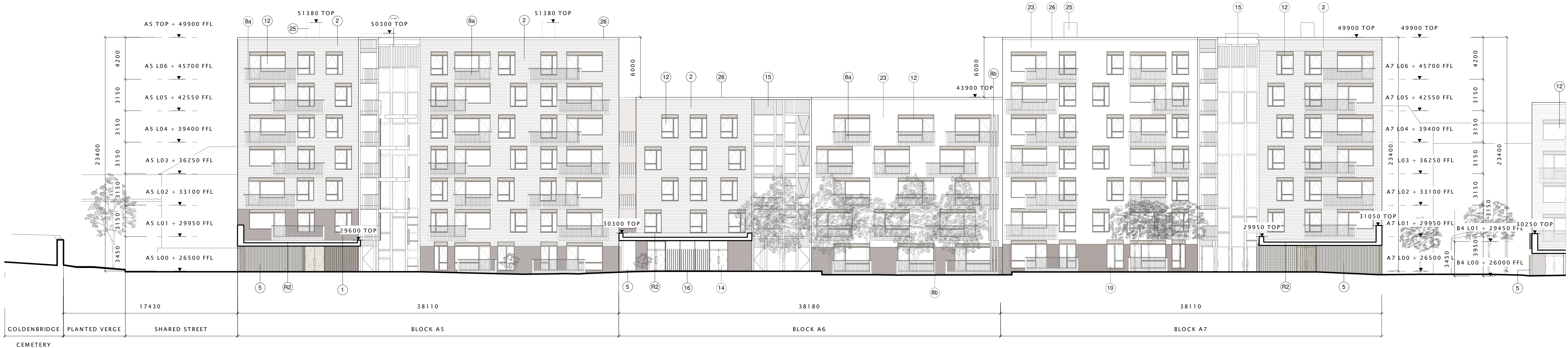
Main Residential Courtyard West Elevation 1/2