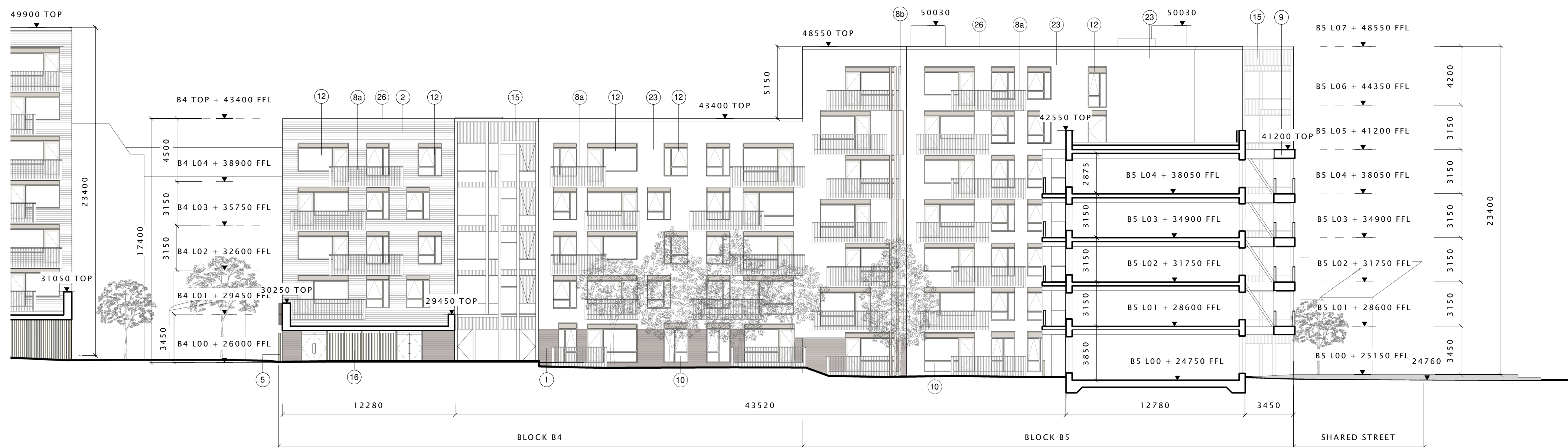
Main Residential Courtyard West Section 2/2